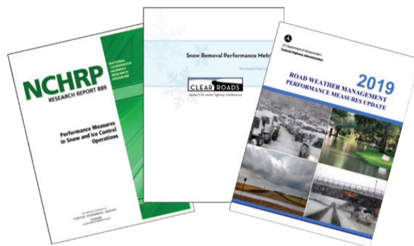
Figure 1. Resources for developing road weather performance measures.

Performance Measures in Snow and Ice Control Operations. 2 The document examines existing snow and ice performance measures and guides agencies toward development of effective performance measures, as well as tools and materials to support performance assessment.